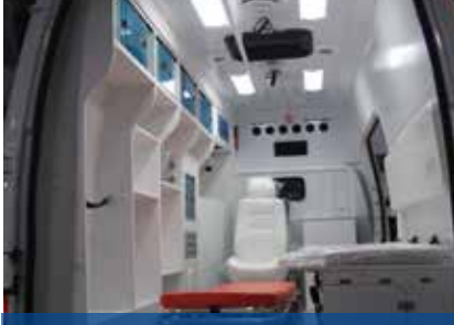
Full height patient care unit