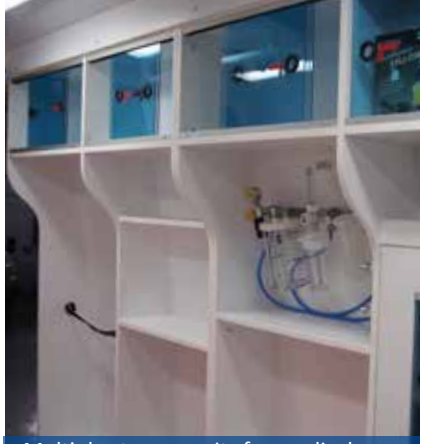
Multiple storage units for medical supplies