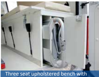
Three seat upholstered bench with underseat stowage