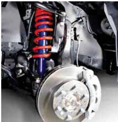
Heavy duty suspension with uprated brake pads