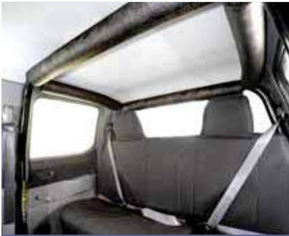
Rollover protection system