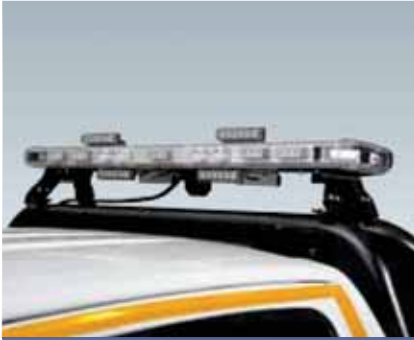
LED light bar