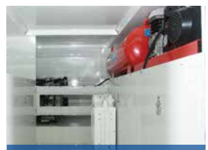
Interior storage for large equipment